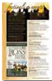
Festivals & Events